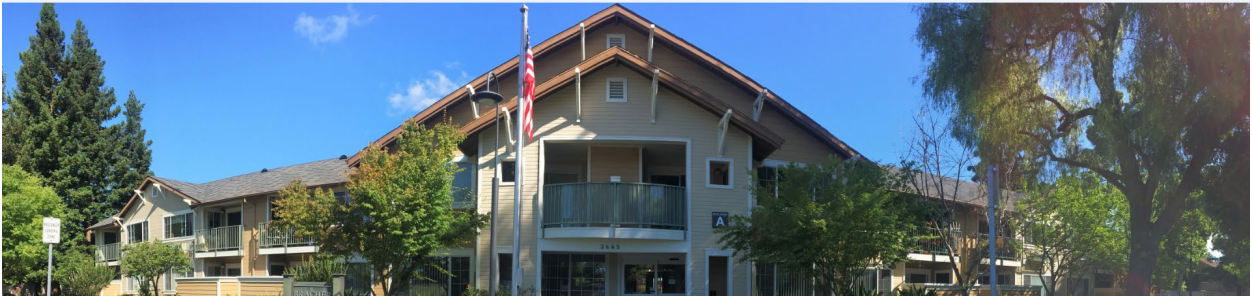
Bracher Gardens Apartments

In 1967, the Santa Clara County Board of Supervisors established the Santa Clara County Housing Authority (SCCHA). SCCHA has an agreement with the City of San José to administer and manage the Housing Authority of the City of San José (HACSJ)'s Housing Choice Voucher program. This MTW Plan presents a consolidated strategy to be implemented for both the County and City programs.